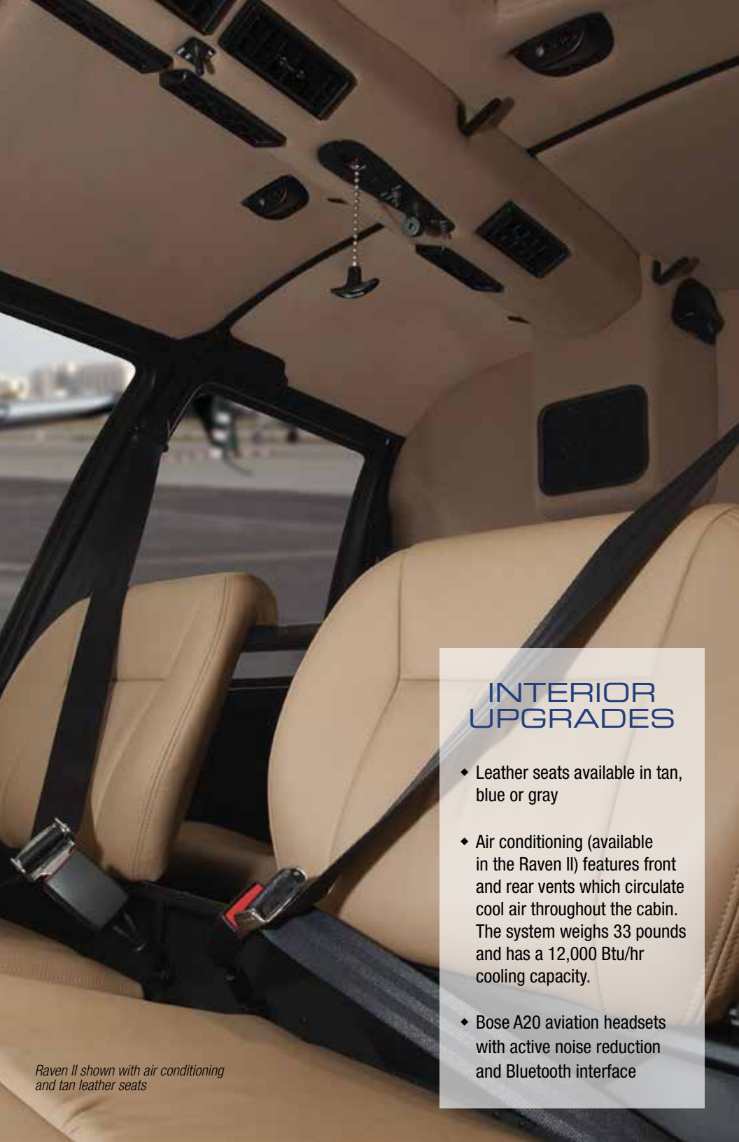
Raven II shown with air conditioning and tan leather seats