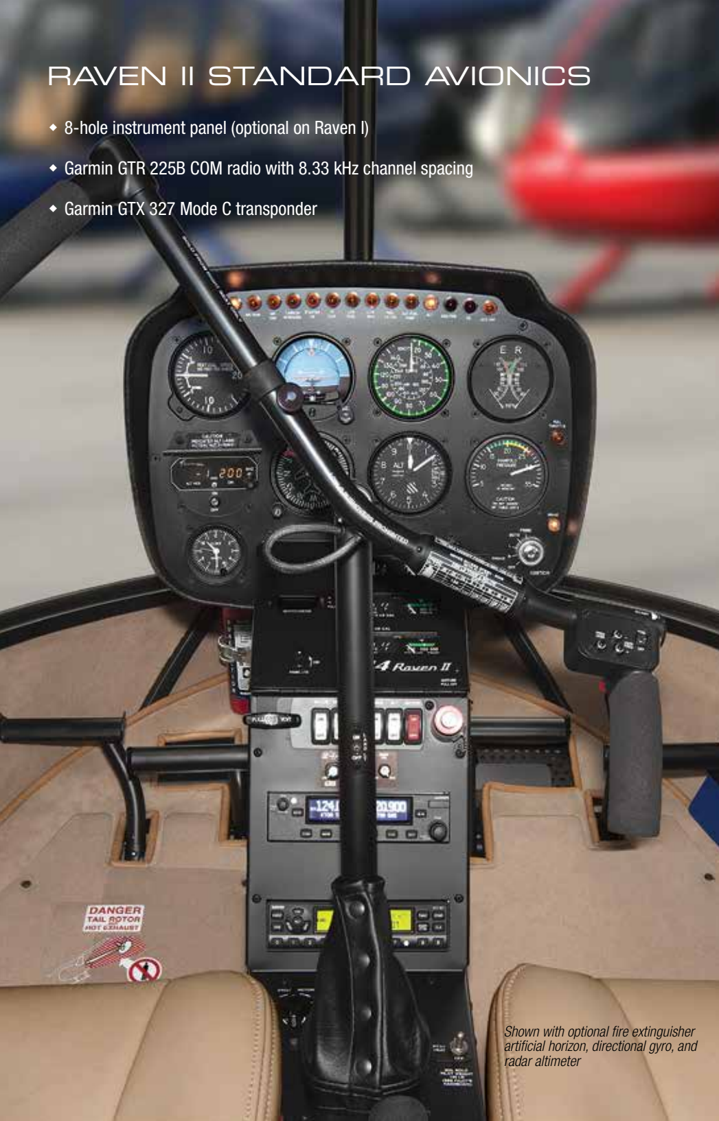
Shown with optional fire extinguisher artificial horizon, directional gyro, and radar altimeter