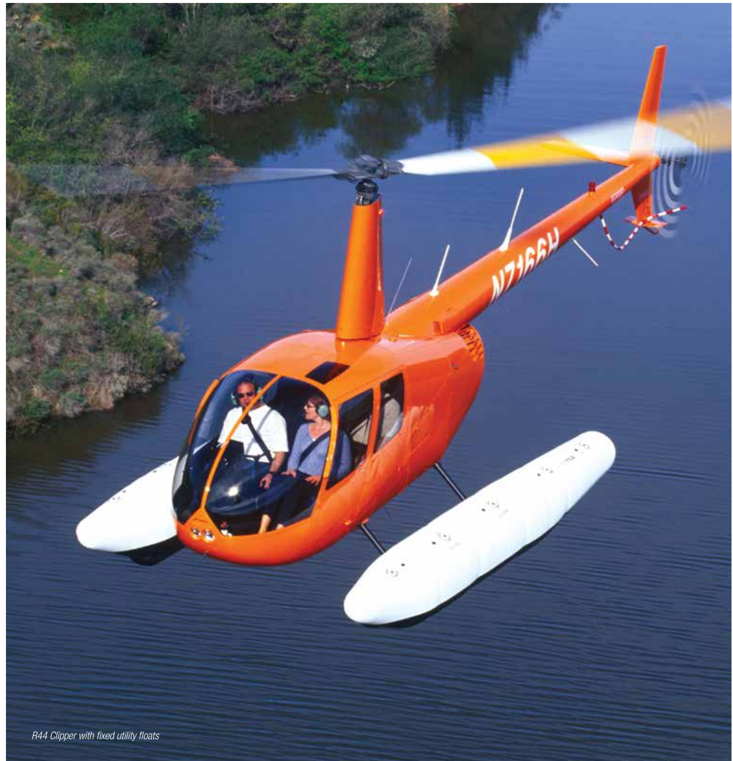
R44 Clipper with fixed utility floats

Pop-out floats require preflight verification of the helium tank pressure, annual leak checks and must undergo emergency deployment tests every three years.