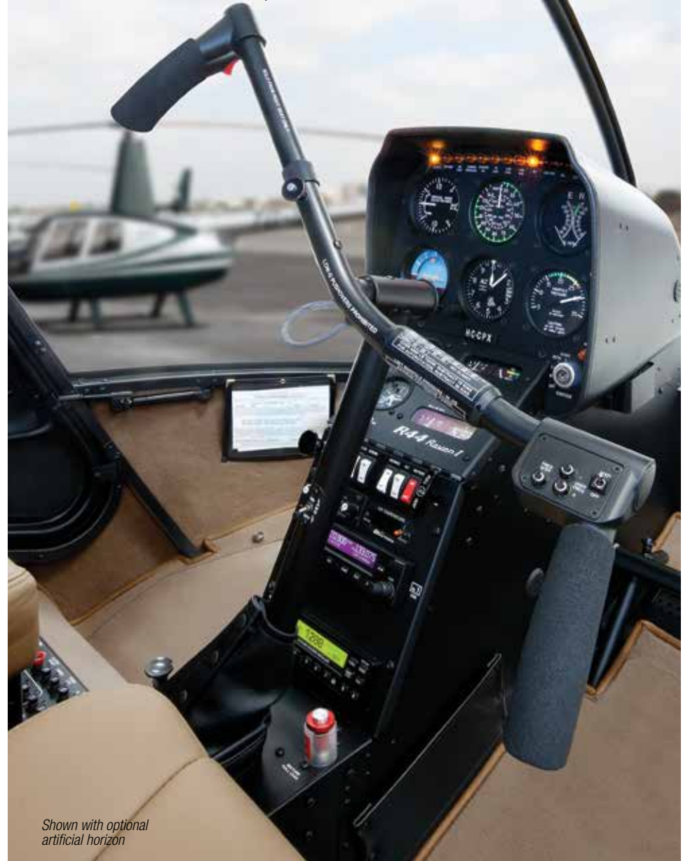
Shown with optional artificial horizon