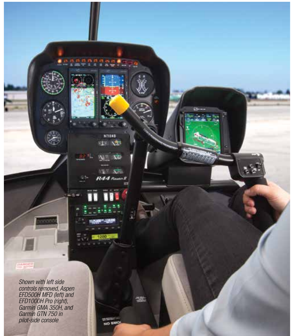
Shown with left side controls removed, Aspen EFD500H MFD (left) and EFD1000H Pro (right), Garmin GMA 350H, and Garmin GTN 750 in pilot-side console