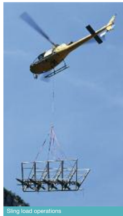
Sling load operations