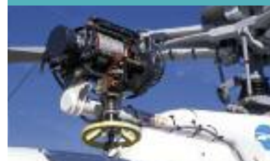
Breeze Electrical Hoist