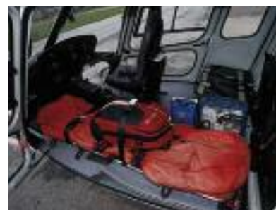
Emergency Medical Service kit