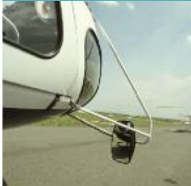
Electrical external mirror